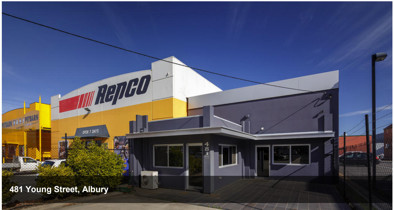
481 Young Street, Albury